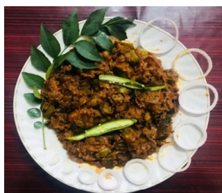
Chilli fish prepared by using fish masala

The fish were marinated for half an hour with 2g confflour, 3g maida, 3g chilli sauce, 3g chilli powder, 5g salt and 15g fish masala/chilli chicken masala. Formarination, the fish were equally divided into two experimental samples- Sample 1: Chilli fish using fish masala and Sample 2: Chilli fish using chilli chicken masala. All the other ingredients used during preparation were kept constant. The marinated fishes were then fried in refined sunflower oil till the color of the fish turned slightly brown. Onion and capsicum were fried in the left over oil along with ginger paste, garlic paste, salt, along with fish masala (in case of sample 1) and chilli chicken masala (in case of sample 2). Soy sauce and tomato sauce were also added.