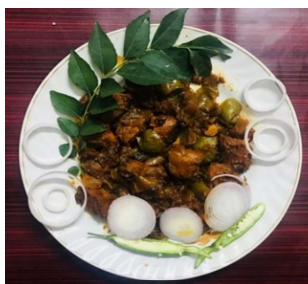
Chilli fish prepared by using chilli chicken masala

The sample prepared with fish masala was kept in deep freezer at -18°C for analysing its quality as well as shelf life during frozen storage.