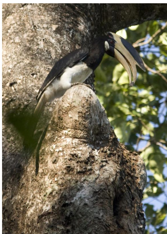
Malabar Pied Hornbill at Nest- Vazhachal

2 Research Fellow, Western Ghats Hornbill Foundation, Mathilakam P.O, Thrissur Dt., Pin - 680685 Kerala, India.